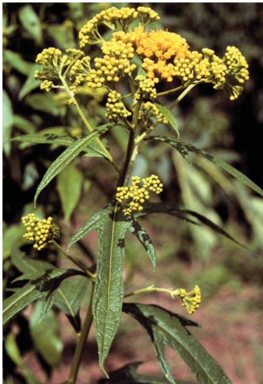
Figure 4. Neurolaena lobata, used to combat fevers, stomach aches, intestinal parasites.