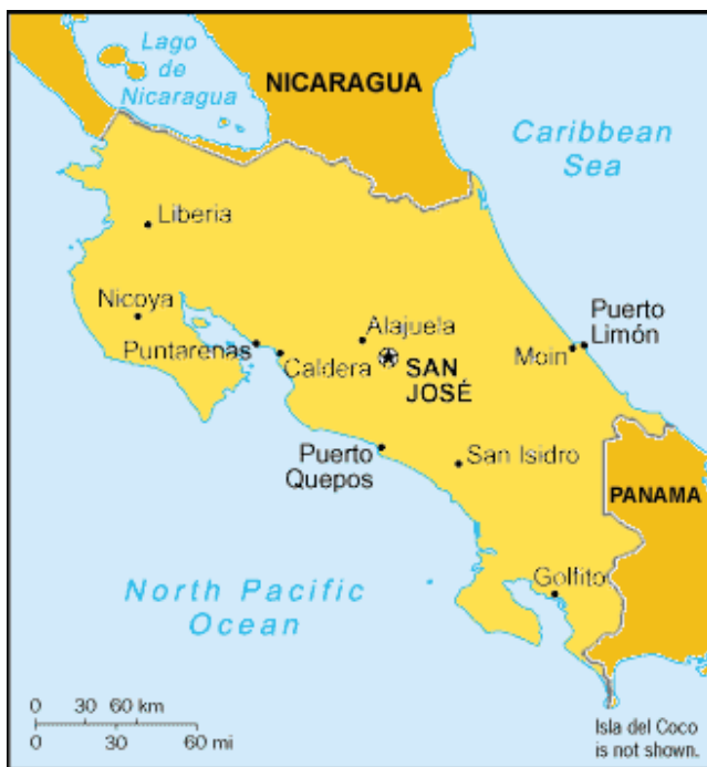
Map based on public domain material from CIA World Factbook .

He walked through the farm, set against the edge of remnant fragments of lowland tropical rainforest. This part of southwestern Costa Rica used to be continuous forests and mangrove swamps, but as the land was developed for fruit plantations, cattle ranches, and other types of agriculture, the forests were cleared. Small wooden houses set on low stilts now lined cleared strips of land between the bananas and the forest edge. Palm trees were left standing to provide some scant shade and so that the workers could make use of the palm fronds for roof thatch. Tangled scrubby, secondary growth vegetation stretched out to the houses from the forest edge, years after the clear-cutting. Many workers lived here to be near the plantation rather than commute from the town of Quepos 65 km away.