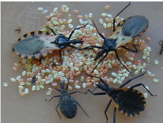
Figure 3. The vinchuca or kissing bug is found in Costa Rica as well as other countries of Central America. Triatoma dimidiata adults, nymphs and eggs.